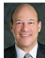
Ari Fleischer White House Press Sec.