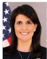
Ambassador to the U.N. Nikki Haley