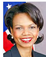
Secretary of State Dr. Condoleezza Rice