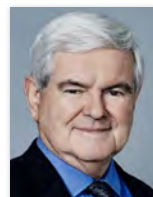
Speaker of the House Newt Gingrich