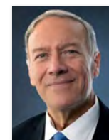
Mike Pompeo Secretary of State