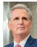
Speaker of the House Kevin McCarthy