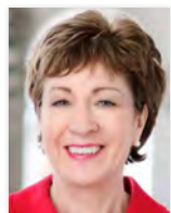
Susan Collins U.S. Senator