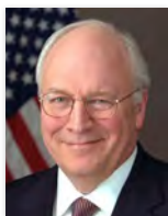
Vice President Dick Cheney