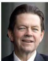
Art Laffer, Ph.D. Fmr. White House Chief Economist