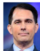
Governor Scott Walker