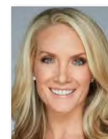
Dana Perino Fmr. White House Press Secretary