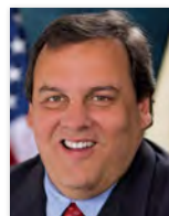
Governor Chris Christie