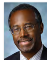
Secretary of HUD Benjamin Carson, M.D.