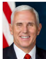
Vice President Mike Pence