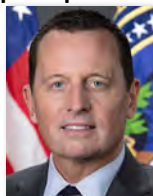
Acting DNI Ric Grenell